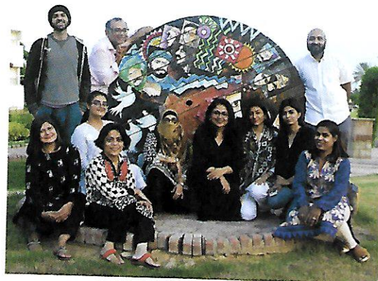
Karachi Biennale Public Outreach Committee